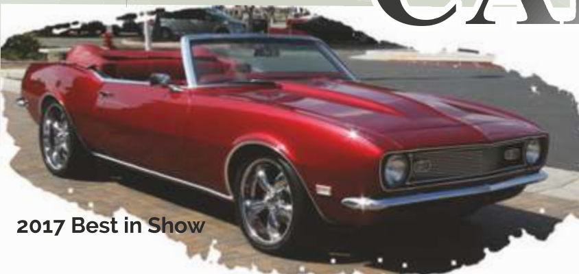
2017 Best in Show